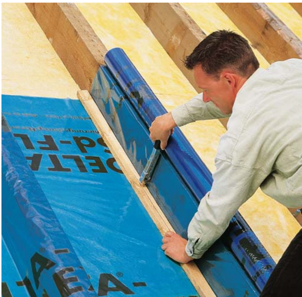
DELTA®-S d -FLEXX may be rolled out quickly and cost-efficiently across the rafters.