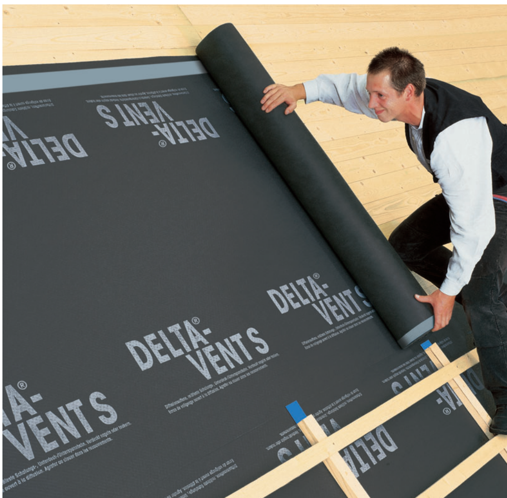
Its 3-ply structure gives DELTA®-VENT S PLUS an advantage in application.